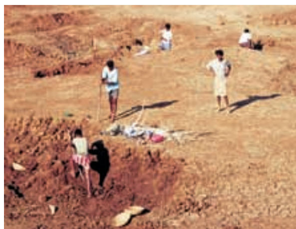
Tank silt improves soil fertility

While structures under the watershed programme, such as percolation tanks, recharged wells in the area, formerly landless people, and others in the village, were being provided with technical inputs and advice by local field staff as well as NGO members. In addition, the villagers were supplementing their agricultural income through a variety of enterprise initiatives promoted through the self-help groups and Village Organisations under the APRLP.